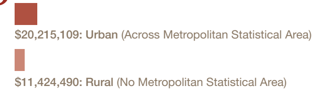
6 GIVING IN AND OUT OF STATE Table NM 6.1: Percent and dollar amount given in-state, out-of-state and international