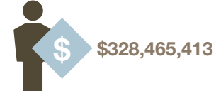
Table AZ 1.3: Total number of dollars granted in Arizona