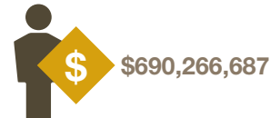
Table AR 1.3: Total number of dollars granted in Arkansas